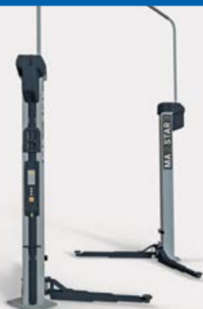
Illustration: MA STAR 3.5 A